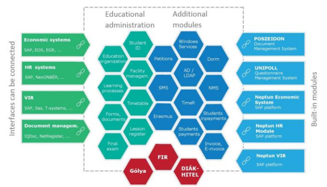
Figure 2. Interfaces and modules [2]

Additionally, each university can choose from many different available modules depending on what specific tasks it wants the system to become suitable for. The following illustration shows the currently available modules and also the interfaces that can be connected to the system.