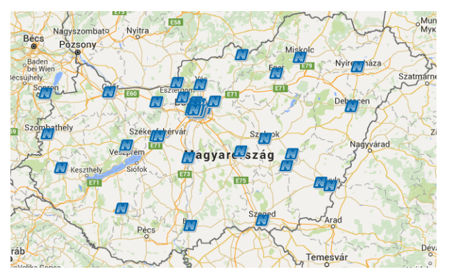
Figure 1. Neptun system user institutions in Hungary [1]

This illustration shows that 44 institutions decided to use Neptun, which is a huge success. Since so many different institution requests were kept in mind while developing the software users may come across interfaces and features that they may not necessarily need, as with all new software. However, in some cases there are features recommended by one institute that can be successfully used by others, too.